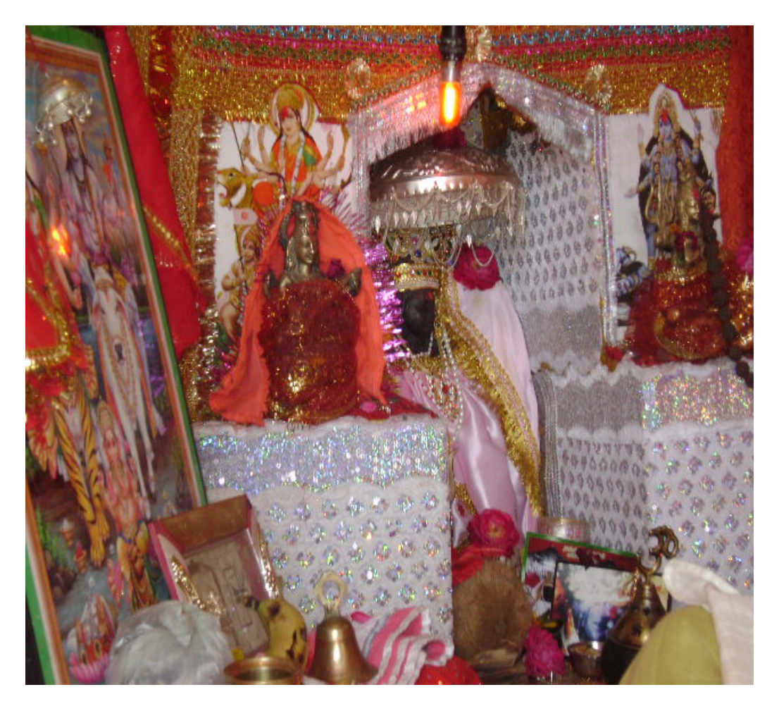
[Sanctum Sanctorum of Sarada Temple]

intention to construct a temple on the spot. No wonder the holy spot became a sacred shrine to which thousands of devotees not only from Udhampur but from distant places