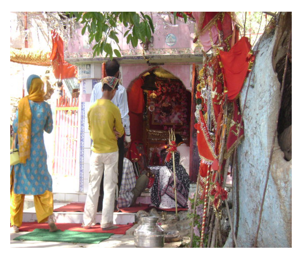
[Sarada Mata's abode in a Trunk of a Black Berry Tree]

The entrance of the temple is from the North-East side. The Divine Mother is facing towards an ancient temple on the opposite side River Tawi situated in a depilated fort. This temple has been built by Raja Udham Singh and there is an asthapan of Mother Nanda [The joy of self-realization. Self-realization is not attained. It is bestowed by the unconditional grace of the Supreme. The supreme joy when graced upon the devotees gives him surprise beyond expectation. That is the goddess Nanda].