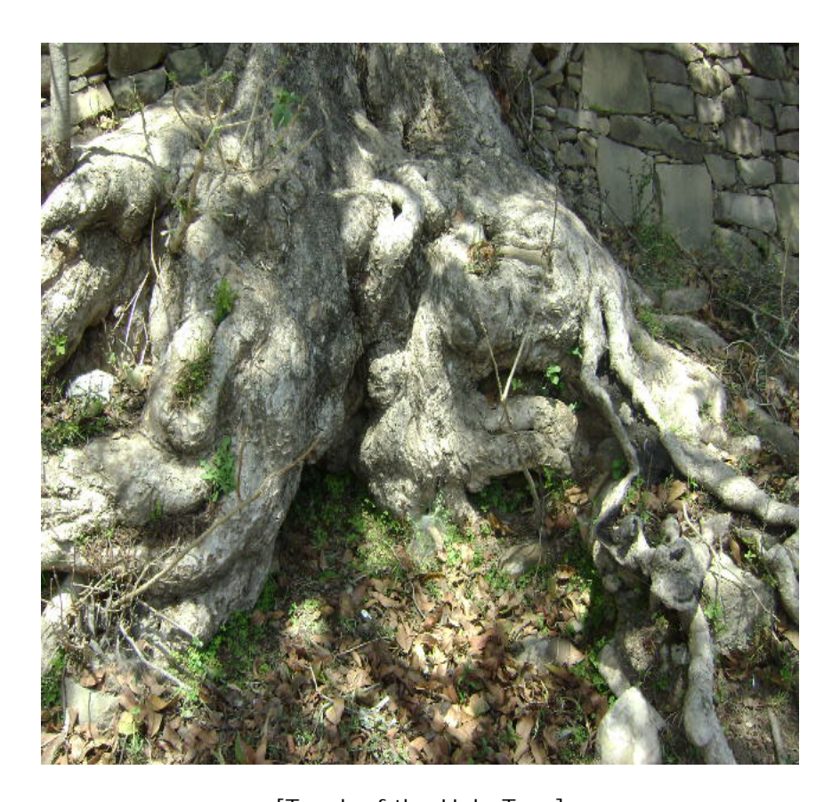
[Trunk of the Holy Tree]

is a hymn meaning Sarda grants the boon of emancipation through wisdom